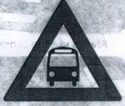
9. Bus stop