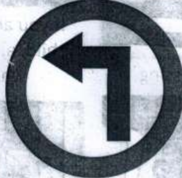
8. No left turn