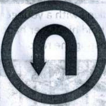
7. No U-turn