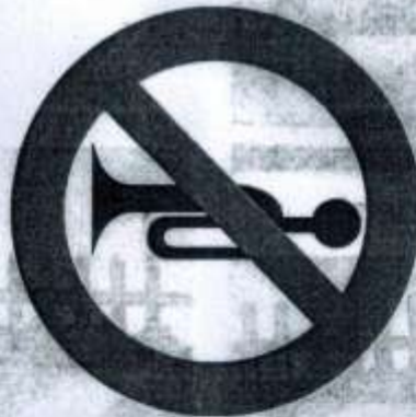
5. No honking