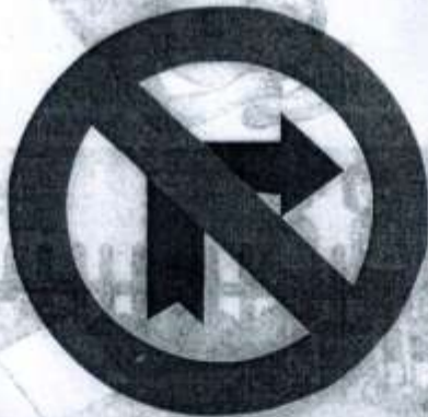
4. No right turn