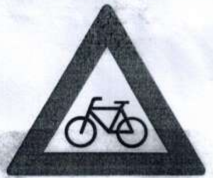
3. Bicycle sign