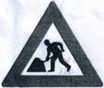
1. Man at work

Q1. Draw and colour these road signs and write what they mean.